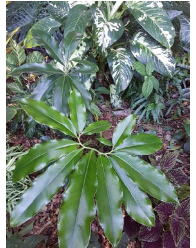
Above left: A gorgeous variegated Monstera deliciosa; above right: Thamatophyllum spruceanum; below: Philodendron melanochrysum